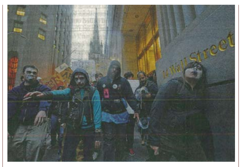
Fear and loathing- Occupy Wall Street demonstrators pose as corporate zombies

protest rights of others. The Court agreed, upholding the removal of almost all the demonstrators (although not Brian Haw, the custodian of the original Parliament Square protest).