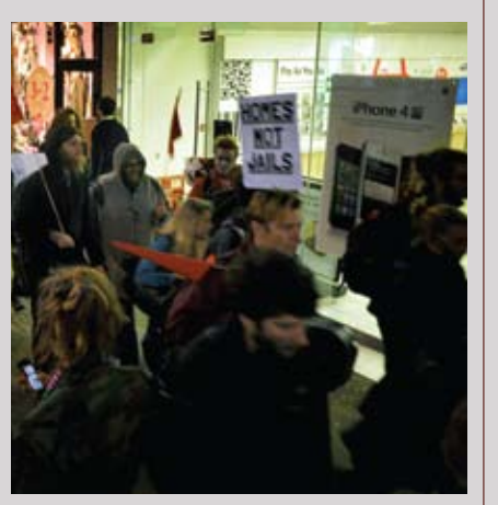
the offence to residential buildings, however, and it will not extend to the land ancillary to those buildings at this stage (p.38).

The Government noted concerns of groups representing Gypsies and Travellers that any new offence could criminalise Gypsy and Traveller encampments on land ancillary to the buildings protected by any new offence. Respondents indicated that it was quite common for Gypsies and Travellers to encamp on land outside disused factories and warehouses, particularly in urban areas. The Government has decided to limit