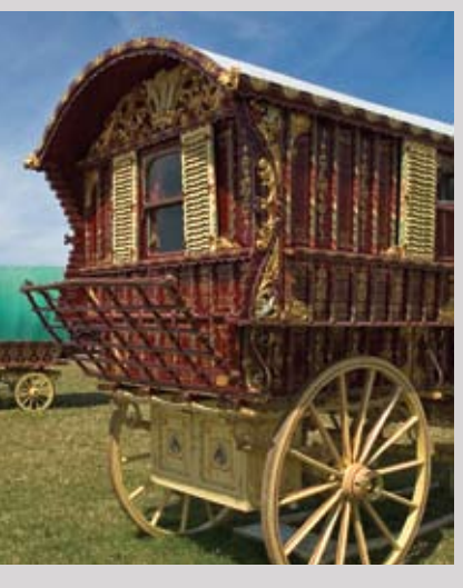
of Gypsy and Traveller for assessment of needs purposes (see further below).